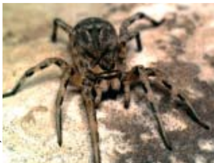
Patients who need spider remedies have an altered sense of the rhythm of life

This is a very frequently reported symptom and often takes the form of just being unable to settle down for the night, especially because the legs feel jumpy and want to keep moving, often forcing the sufferer to get up and pace around to calm things down. The general night-time restlessness can be helped by Arsenicum album or sometimes by Rhus tox. Restless legs often do well with Zincum metallicum.